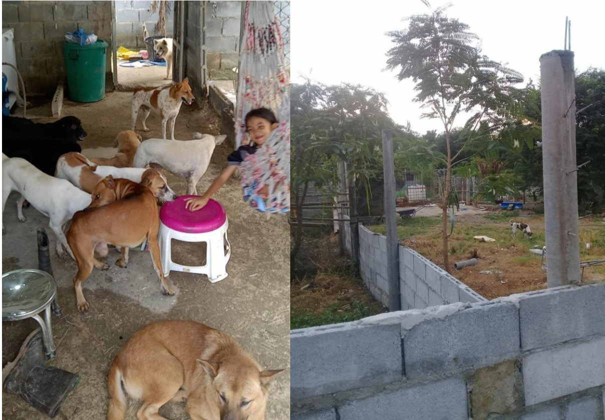
Figure 5+6. Keeping the dogs company. And work on internal walls and fences is underway.