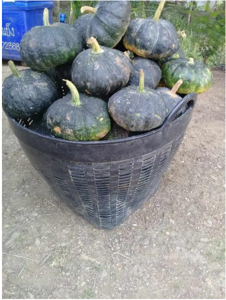
Figure 2. pumpkins augmenting dog food.