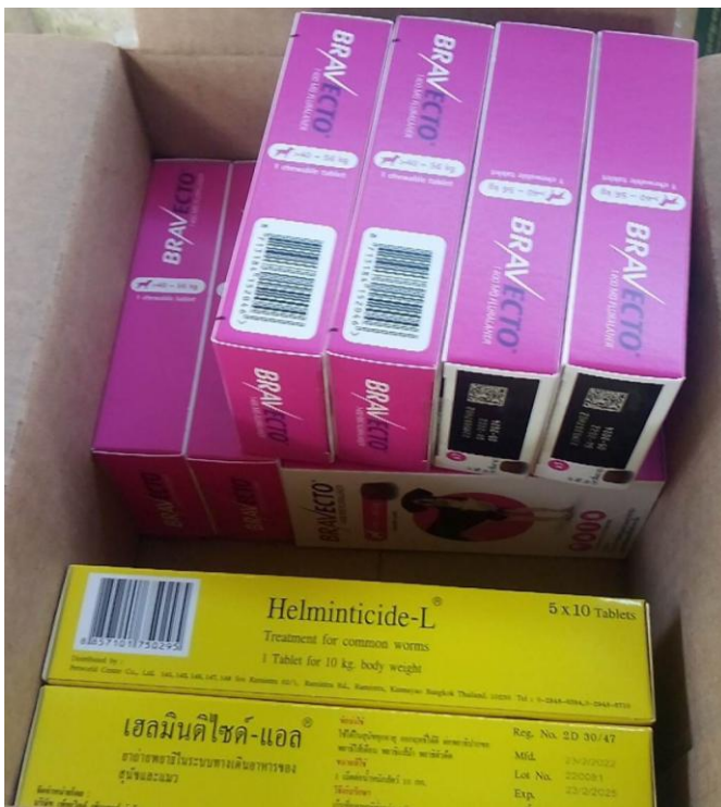
Figure 8. An important box of expensive medicines, especially the bravecto.