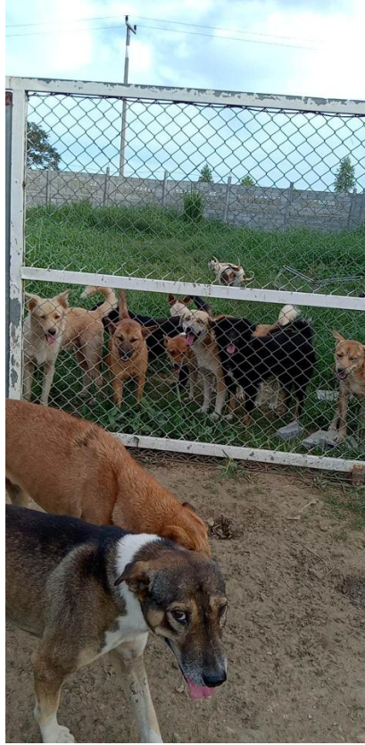
Figure 3. One of the fences separating some packs of dogs.