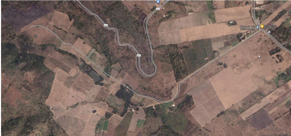
Overhead satellite image showing the shelter on the right and the small street going to the left for a few houses and farmland. Everything past that is a national park.