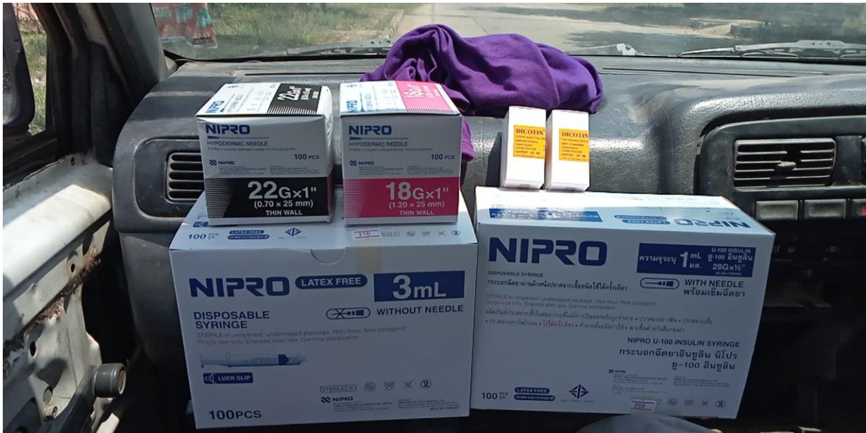
Needles and medicines from the store during one of several trips to get medicines and other accessories.

More information on separate projects including expenditure details and pictures can be found on our website www.houseoftails.org and on our Facebook page www.facebook.com/sthouseoftails .