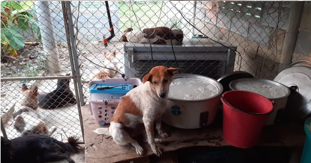
Figure 5 +6+7. Dogs "helping" with food preparation.