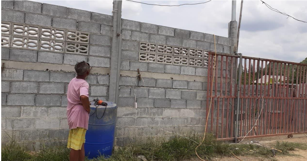
Inspecting the Wall and power cables.