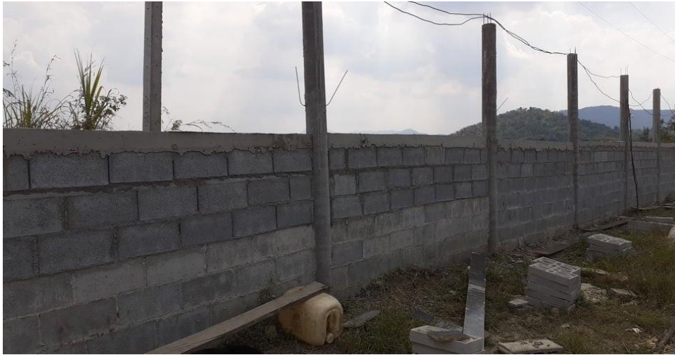
Figure 4. Work on the outside wall in the new area.