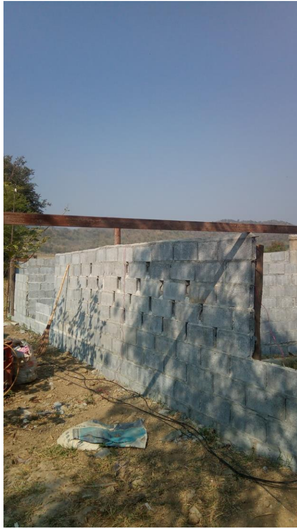
Figure 8. Construction of the 3 rooms at the North-West side of the shelter. These are meant to house at least 2 dogs each, function as quarantine rooms when we have sick dogs. And behind it there will be a small storage space. All 3 rooms open up in a free space with a fence. Meanwhile the roof and such are finished for these rooms.

More information on separate projects including expenditure details and pictures can be found on our website www.houseoftails.org and on our Facebook page www.facebook.com/sthouseoftails .