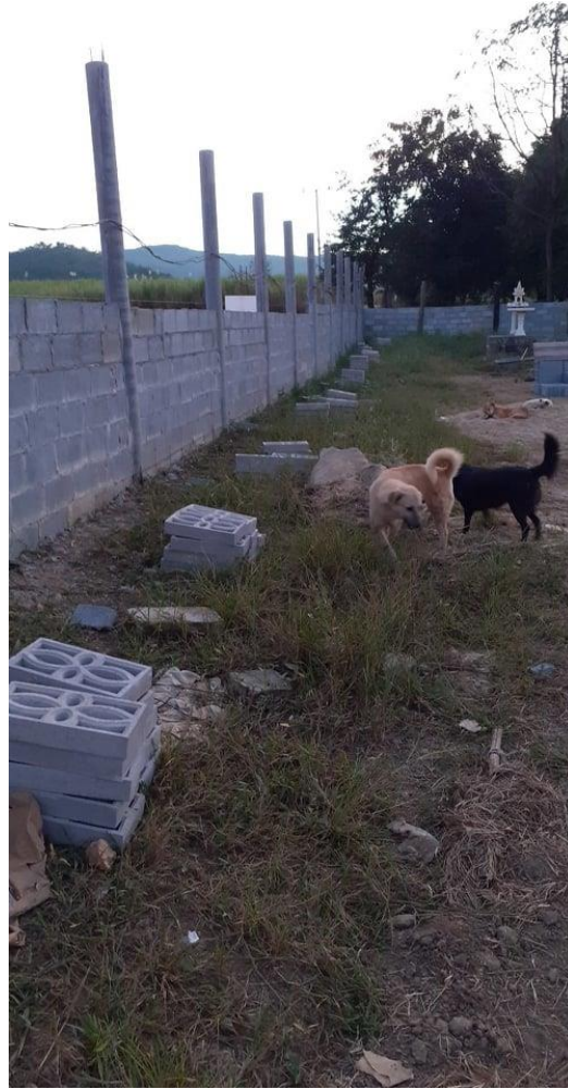
Figure 6. Construction of the South-West wall. To the left is along the sandy road and at the back is the West side. The dogs are inspecting the progress.