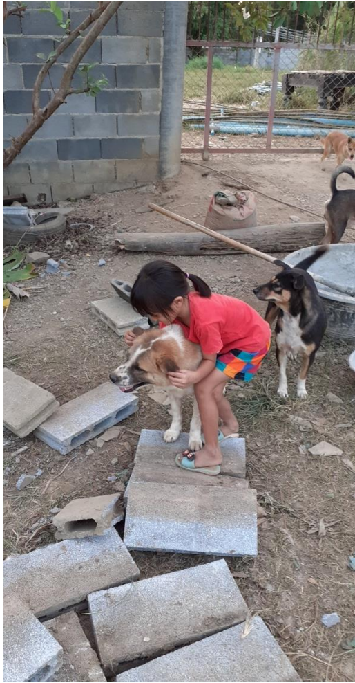
Figure 5. One of Kiau's daughters playing with the dogs. The dogs appreciate having company and somebody to play with.