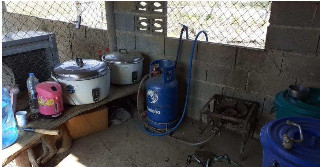
Figure 4. The new kitchen area with rice cookers, water cooker, a gas burner, some storage and working areas.