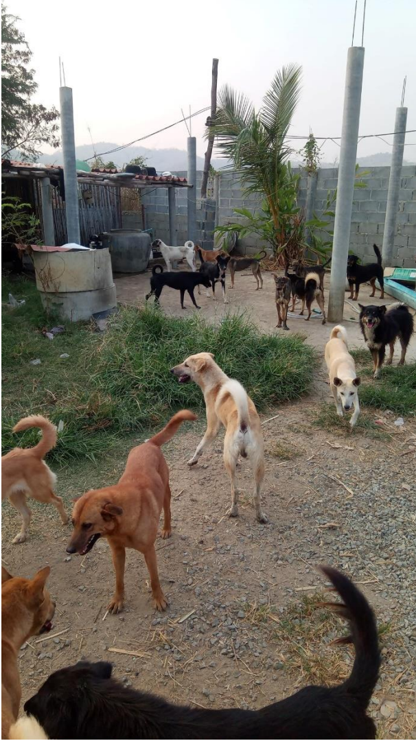
Figure 2. Part of the main open area with some of the dogs.