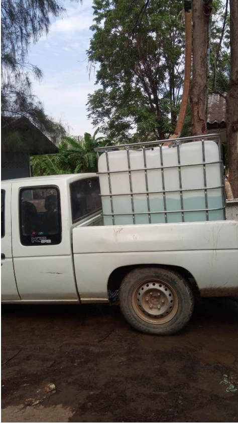
Figure 3. Water storage for the car to collect from government water facilities.

More information on separate projects including expenditure details and pictures can be found on our website www.houseoftails.org and on our Facebook page www.facebook.com/sthouseoftails .