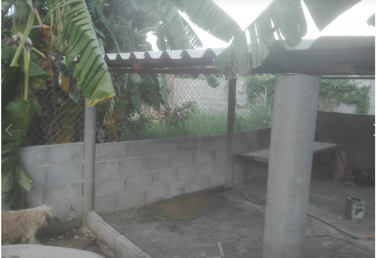
Figure 2. Mohk's shelter (also called Mom's shelter).

More information on separate projects including expenditure details and pictures can be found on our website www.houseoftails.org and on our Facebook page www.facebook.com/sthouseoftails .