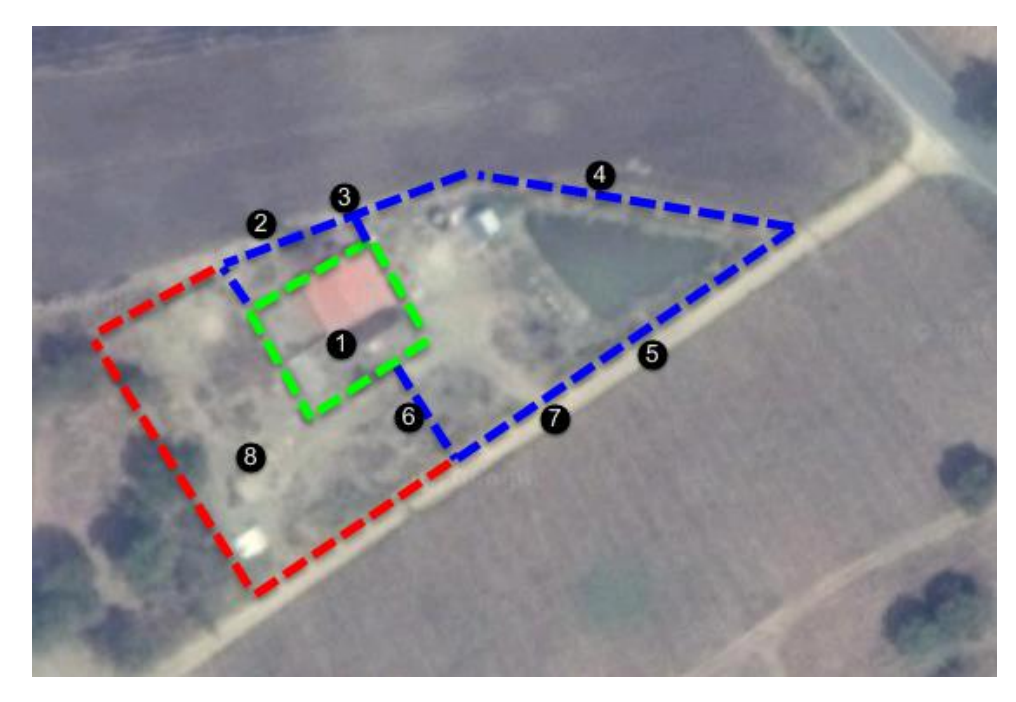
Figure 1. Our shelter area with blue line being the front wall constructed in 2016.

The kitchen and bathroom projects have added to the living situation of staff working at the shelter, where this was previously not feasible. Also the kitchen project was needed to improve the possibilities of daily food preparation and washing dishes.