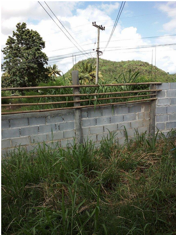
Figure 2. Part of the front wall while still under construction

The kitchen and bathroom projects have added to the living situation of staff working at the shelter, where this was previously not feasible. Also the kitchen project was needed to improve the possibilities of daily food preparation and washing dishes.