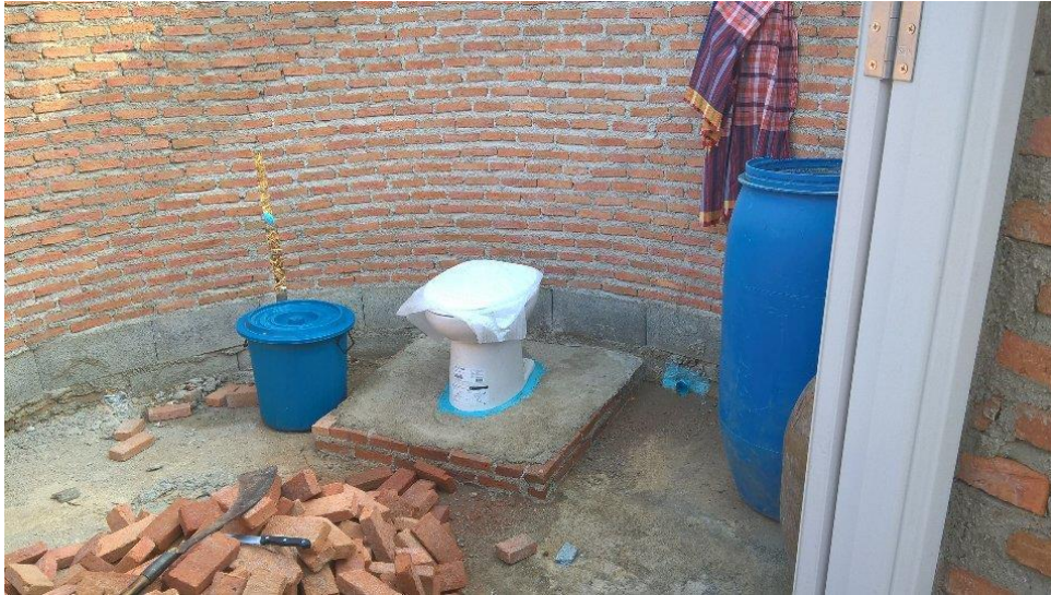
Figure 3. Bathroom project in progress

In 2016 we have tried to work on our goal to sterilize a number of dogs to prevent growth in numbers in the shelter. We have not been able to meet this goal in 2016 due to lack of funding.